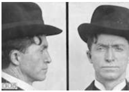
Nine Kinds of Ancestors You Could Find on Your Family Tree