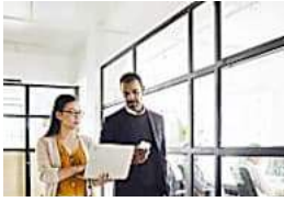
Why Google Workspace for Business is Worth the Upgrade