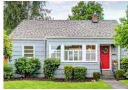
Get Mortgage Advice Close to Home