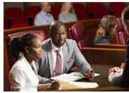
Walmart Center for Racial Equity Update: Advancing Equity in Criminal Justice