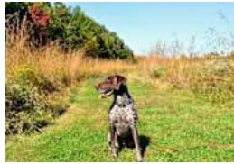
Get Dog Food Designed for Your Dog's Health & Happiness