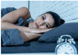
The Close Relationship Between Stress and Sleep