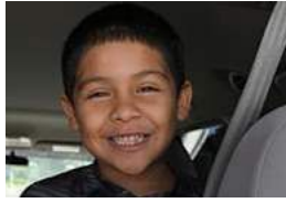
Four Ways Food Banks Are Feeding Kids Right Now