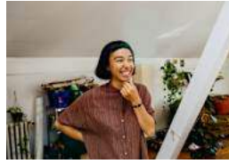
Is My Space a Good Fit for Airbnb?