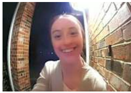
Ring Devices Help Make Peace of Mind More Accessible to All